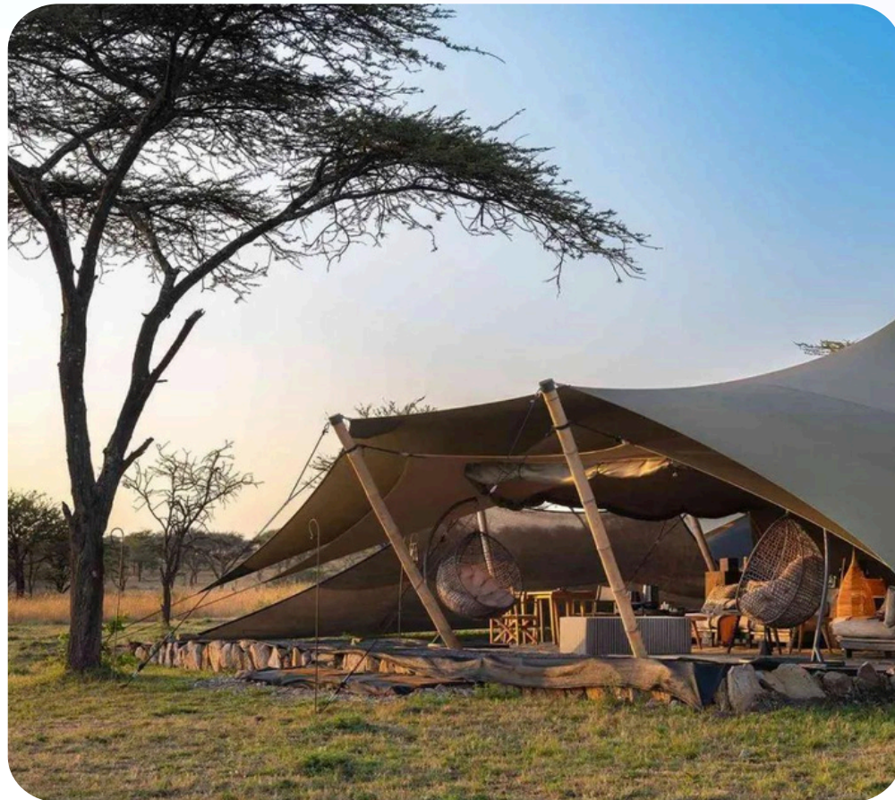
Serengeti: Serengeti Safari Camp