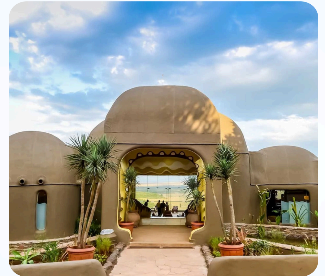
Masai Mara: Mara Serena Safari Camp