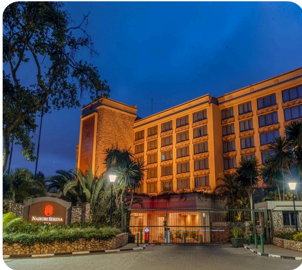
Nairobi: Nairobi Serena Hotel or similar