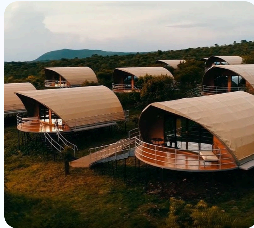
Ngorongoro: Ngorongoro Safari Camp