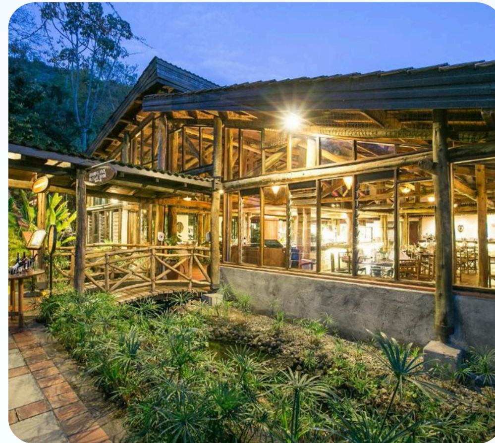
Lake Nakuru: Sarova Lion Hill Game Lodge (Lake Nakuru)