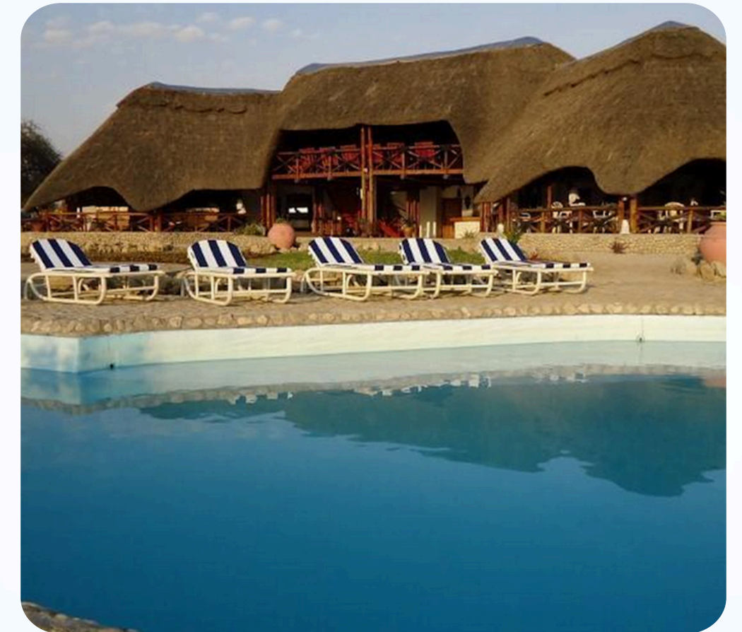
Manyara: Manyara Safari Camp